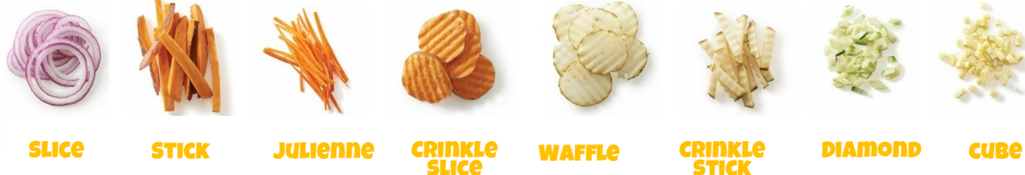
SLICE STICK JULIENNE CRINKLE SLICE WAFFLE CRINKLE STICK DIAMOND CUBE