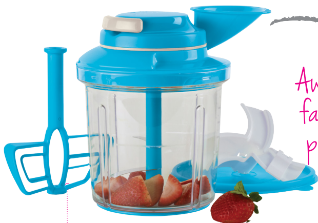
POWER CHEF® SYSTEM